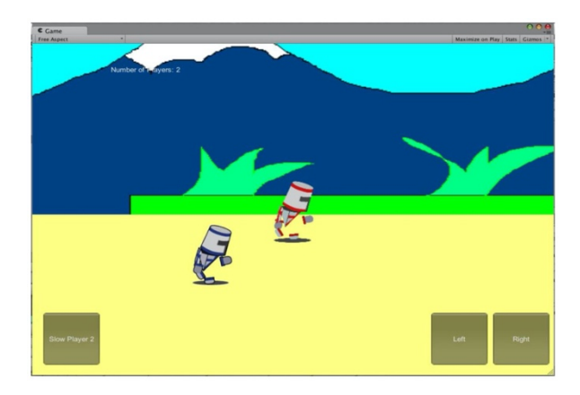
Fig. 2 Racing Game Screenshot